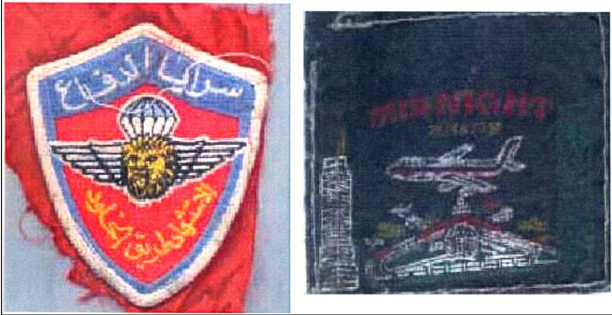
Military patches found along the Texas border.