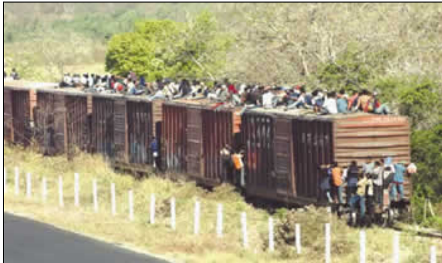
Trains from Central America and Mexico en route to the U.S. border

The South Texas region covers approximately 625 miles of border territory – a total area of 20,963 square miles and borders three separate Mexican States. Inside the territory are 11 Ports of Entry that include 15 international bridges. Directly across the cities of Brownsville, McAllen, and Laredo are major Mexican cities, each with a population between 600,000 and 800,000.