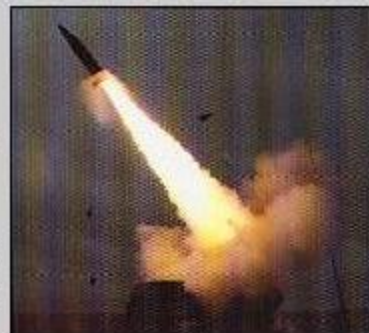
August, 28 October