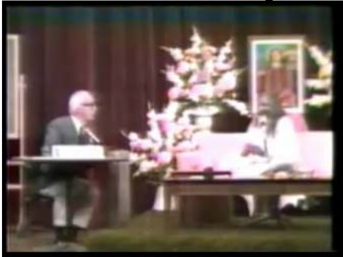
Transformation and Integration