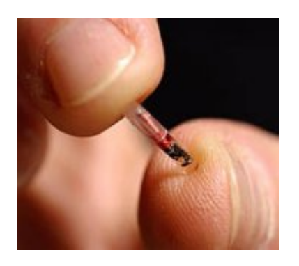
...And This Baby Will Never Know Freedom From State Surveillance and Control