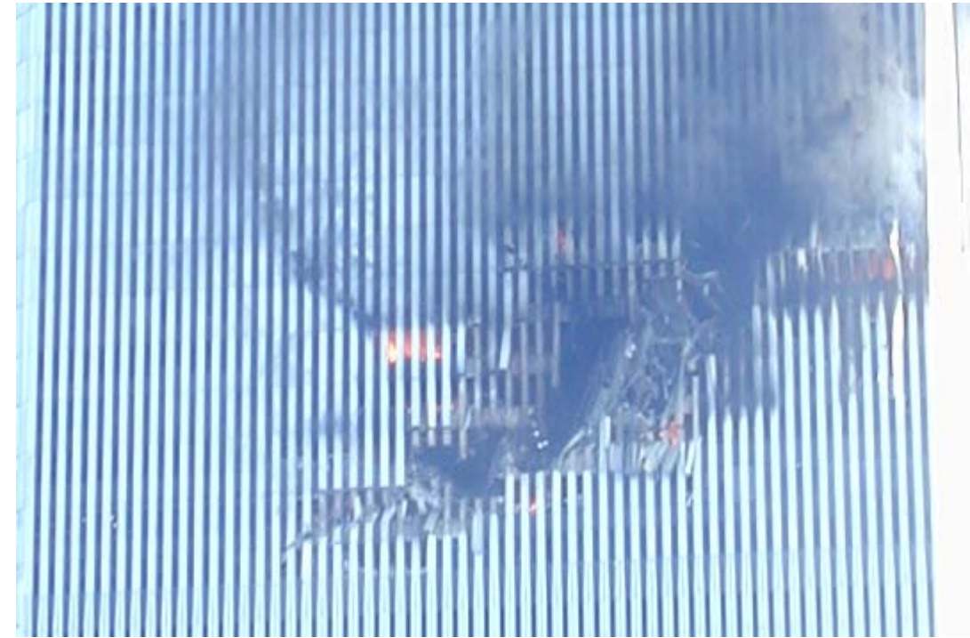
Click HERE for the original picture. HERE for a better distance shot. HERE for others.

Now think of the videos you've seen of the airplanes flying into the building. Very smooth entry, which "they" explain by the speed of the airplane and some people point to the flash which some say is a laser or explosives (although the timing of the explosion is off for that to be the case and explosions aren't precise enough to cut the pattern shown and still not be visible in the videos). At the left, there is an indentation that implies a wing but it doesn't cut through which means that on the videos we should see the wing crumple at a minimum. Also notice the angle of the image – it implies an angled entry but the videos show a straight in shot. You might want to question the inward bent of the columns that would be reasonable but there were some Israeli "art students" who rented space in the WTC for some kind of stunt. They did remove a window and their explanation was not satisfactory. What they could have been doing was planting explosive material on the external columns of the building so that there would be an inward push to give the illusion of the entry of the wing.