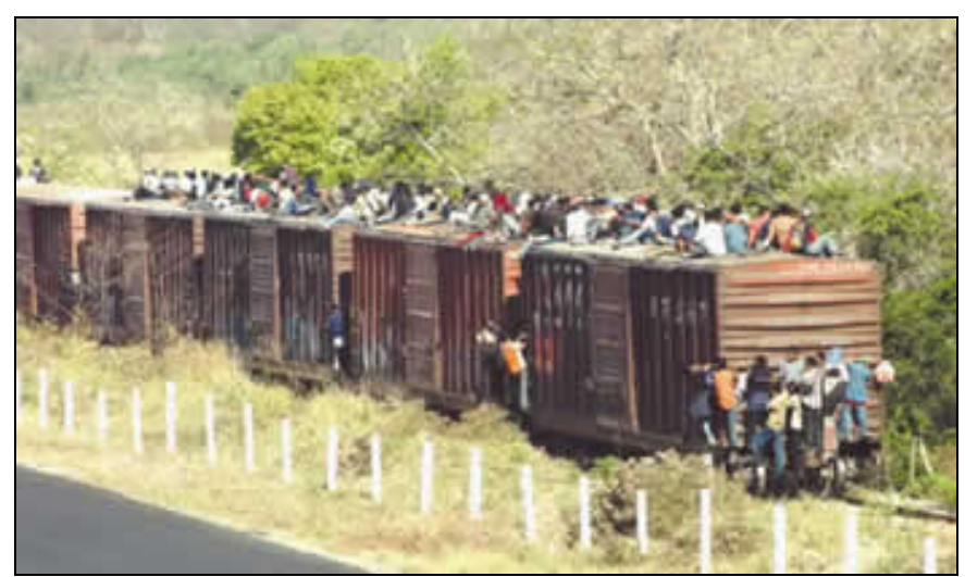
Trains from Central America and Mexico en route to the U.S. border

The South Texas region covers approximately 625 miles of border territory – a total area of 20,963 square miles and borders three separate Mexican States. Inside the territory are 11 Ports of Entry that include 15 international bridges. Directly across the cities of Brownsville, McAllen, and Laredo are major Mexican cities, each with a population between 600,000 and 800,000.