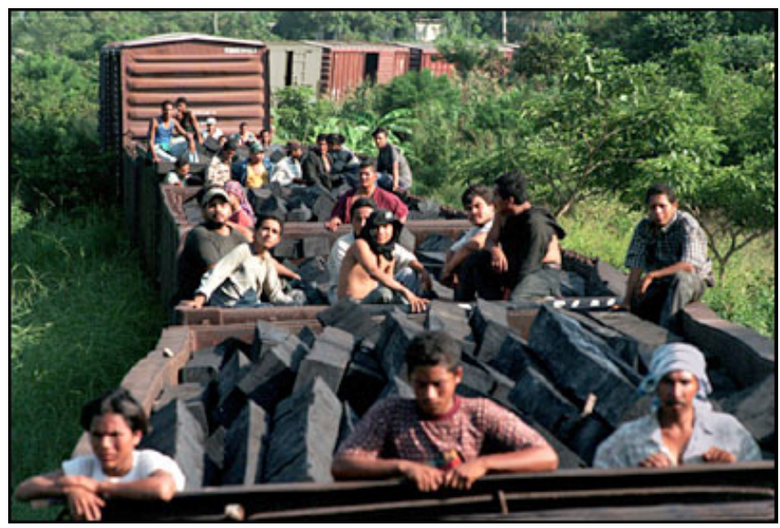
Trains from Central America and Mexico en route to the U.S. border