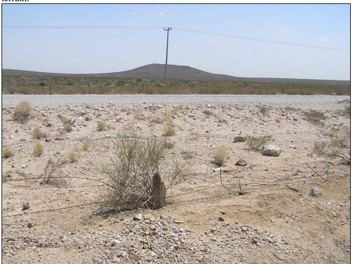
U.S.-Mexico border in New Mexico

The United States border with Mexico extends nearly 2,000 miles along the southern borders of California, Arizona, New Mexico and Texas. In most areas, the border is located in remote and sparsely populated areas of vast desert and rugged mountain terrain.