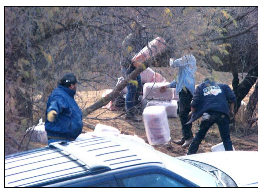
Cartel members unloading drugs after failed attempt at U.S. entry during alleged military incursion January 23, 2006

On January 25, 2006, the Ambassador sent a Diplomatic Note to the Mexican Government regarding the January 23, 2006 border incursion in Hudspeth County, Texas. Ambassador Garza requested the Mexican government fully investigate the January 23 incident in which individuals dressed in military uniforms, carrying military-style weapons, and using military vehicles intervened to prevent a drug shipment from being intercepted by U.S. law enforcement operating in the United States.<sup>71</sup>