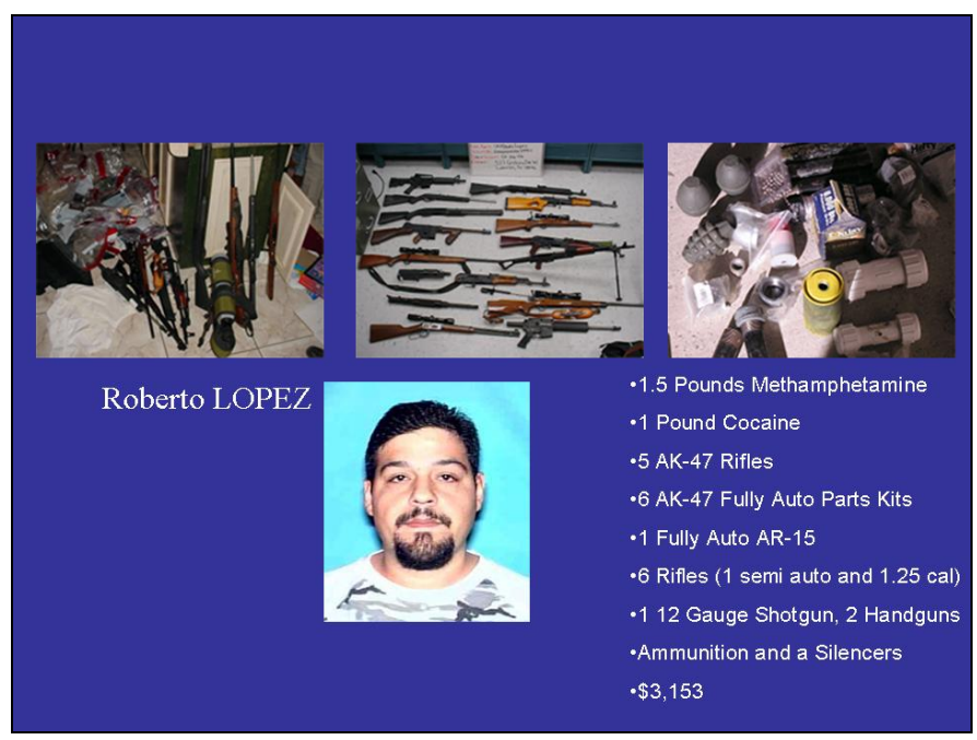
Weapons cache seized in Laredo, Texas January 26, 2006

Drug cartels and the other criminal organizations they leverage and employ continue to develop new techniques that impede detection by law enforcement agencies. Despite the more than one thousand border patrol agents who work in the Laredo area, despite the dozens of thermal imaging cameras along nearly 200 miles of border, and despite the checkpoints along major highways, local law enforcement officers have indicated that the smugglers know how to slip through by using private property to circumvent the roadblocks. According to Sheriff Flores of Webb County, Texas, "[f]or all the beefed up enforcement on the border, the drug cartels appear stronger and more violent than ever."