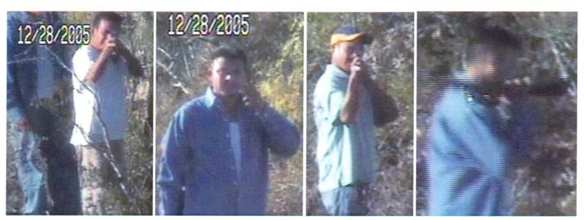
On December 28, 2005, while apprehending a group of undocumented aliens, two border patrol agents were fired upon by an unknown assailant on the Mexican side of the border. A CBP Remote Video Surveillance camera operator was able to capture pictures of the likely assailants, shown above. Since this incident, the same assailant (2<sup>nd</sup> from the left) has been tied to three other incidents involving shots fired at CBP Border Patrol Agents.

Between May 2004 and July 2006 there have been forty-nine reported abductions of U.S. citizens in the region between the Texas cities of Del Rio and Brownsville. Thirty-four of these abductions occurred in Nuevo Laredo and involved U.S. citizens who had crossed the border. Twenty-three victims were released by their captors, nine victims remain missing, and two are confirmed dead. These numbers likely represent only a fraction of the actual occurrences, as many kidnappings of U.S. citizens go unreported.