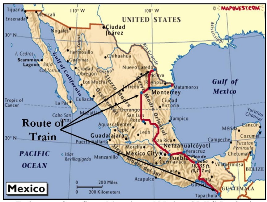
Train routes from Central America and Mexico with U.S. Destinations

The El Paso-Juarez corridor in west Texas also serves as the gateway for drugs destined to major metropolitan areas in the United States. Mexican drug cartels transport significant quantities of marijuana and cocaine through the El Paso Port of Entry using major east/west and north/south interstate highways. These highways provide the Mexican cartels with transportation routes for drug distribution throughout the United States. Drug cartels also obtain warehouses in El Paso for stash locations and recruit